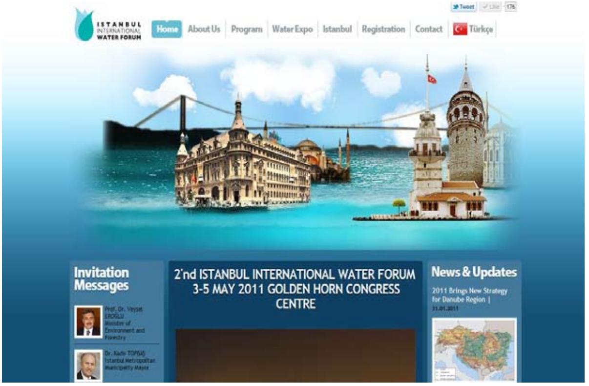
A snapshot of the Forum website

was also the main platform for online registration and submission of contributions to the Forum's thematic sessions. The Forum website had 27,089 visits in total with an average of 5,36 pages/visit and 145,068 pageviews between January and August 2011.