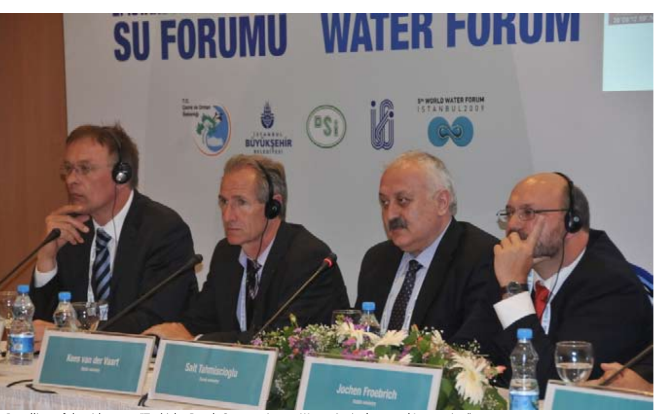
Panellists \ of the side \ event \ "Turkish - Dutch \ Cooperation \ on \ Water, \ Agriculture \ and \ Innovation"

Dutch and Turkish specialists proposed solutions for problems in water allocation, sustainable water management and wastewater treatment and discussed opportunities for innovation in agriculture and land consolidation. Specialists treated social and financial aspects of water management and introduced the joint projects of Dutch Government Agency for Land and Water Management (DLG) with Turkish Ministry of Agriculture and Rural Affairs and Ministry of Environment and Forestry.