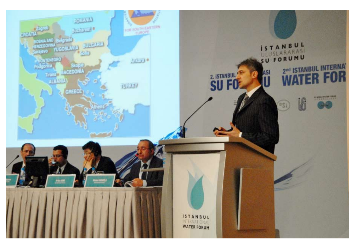
Session 4.1. Hydro-meteorological Disasters

This session discussed the driving forces and pressures on hydro-meteorological disasters. It was noted that the frequency of droughts and floods in various regions of the world are increasing in terms of frequency and magnitude. The phrase "think global, act local" was adopted as a key message expressing a general agreement. The importance of linking activities from regional to global level was emphasized to develop a multidisciplinary and multi-sectoral approach and multinational cooperation and participation at all levels. A project in Korea undertaken with the purposes of securing water, river-oriented community development, creating public spaces for residents, improving water quality and restoring ecology and flood risk mitigation was evaluated as an example of regional cooperation. Awareness raising in disaster management, education, transparency, participatory approaches in climate change mitigation and adaptation strategies were addressed. It was also noted that governments should focus on "regional know-how sharing" at global level for risk identification, assessment, monitoring and early warning systems.