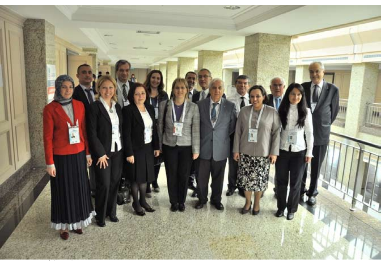
Participants of the Turkey Focus Meeting

Focusing on sustainable agricultural production and food safety and security, the meeting covered the necessity of modern irrigation systems, integrated basin management, green agriculture practices, training of farmers and effects of new regulations and policies on water users unions.