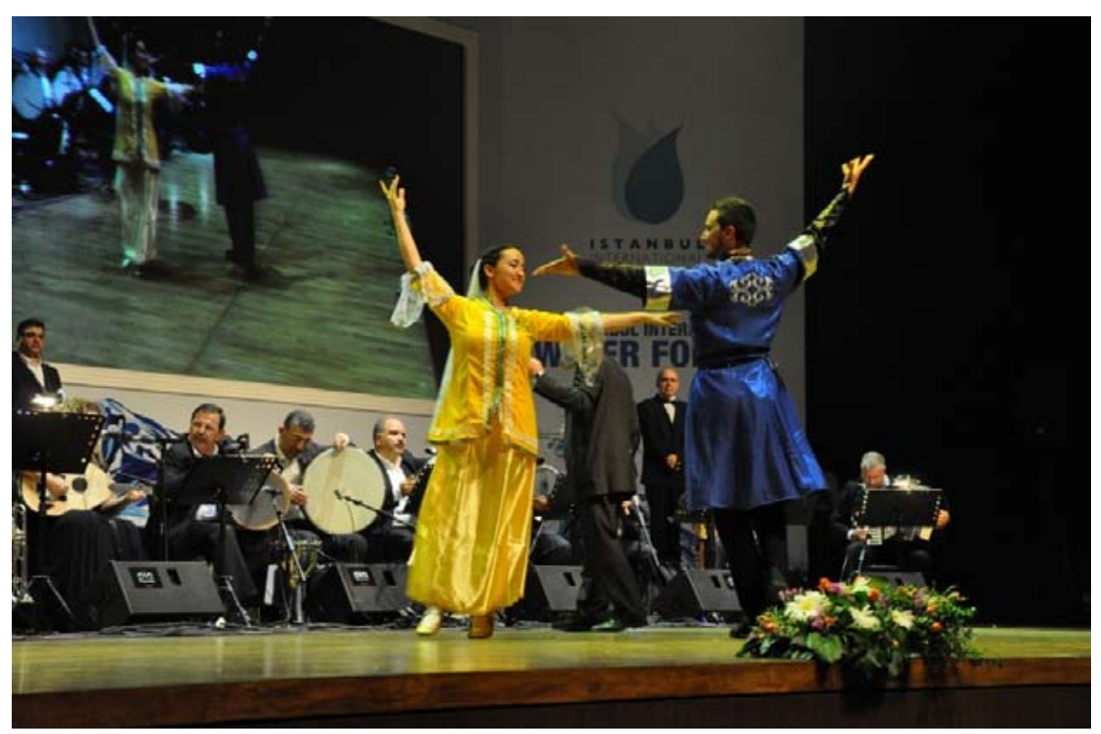
Istanbul Live Production

On the evening of the second day of the Forum, the Dostane group that is composed of state artists of the Ministry of Cultural Affairs staged a performance of traditional Turkish folk songs and dances.