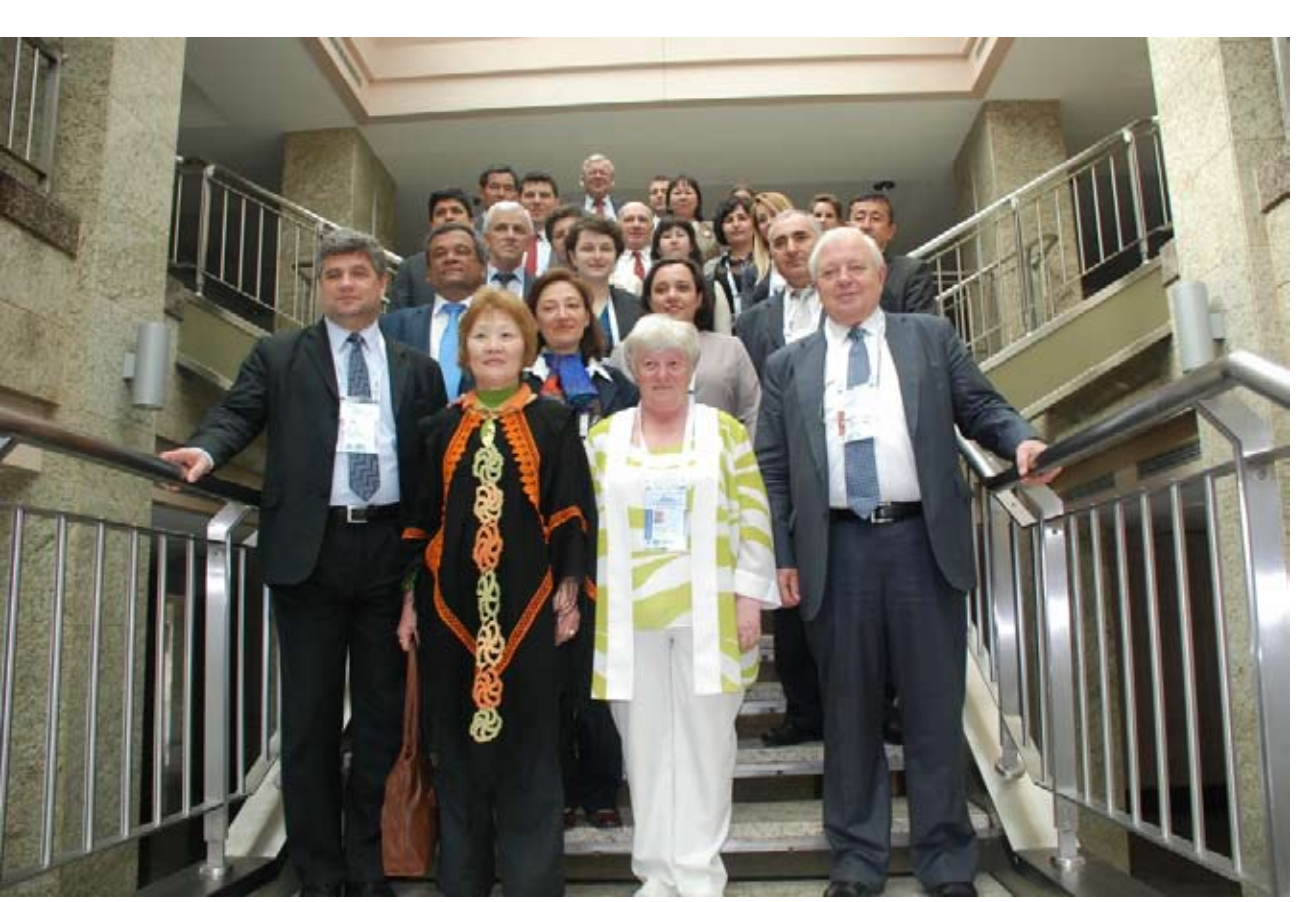
Participants of the Central Asia Regional Focus Meeting

The meeting concluded that water security is the key for regional food security. A more efficient allocation and integrated management of water resources based on regional cooperation and agrarian specialization, institutional and legal reforms, affordable technologies and finance are the top priorities for water security. Articles 46-50 on "Water and Food for Ending Poverty and Hunger" included in the Istanbul Water Guide, an important political output of 5<sup>th</sup> World Water Forum, were accordingly addressed.