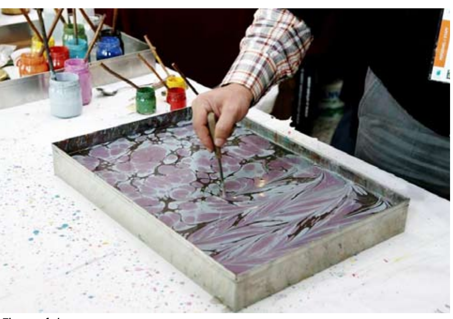
The art of ebru

This exhibition included examples of traditional Turkish arts and crafts of tezhip , ebru , calligraphy and miniature created by the artists of Istanbul Embriodery House.