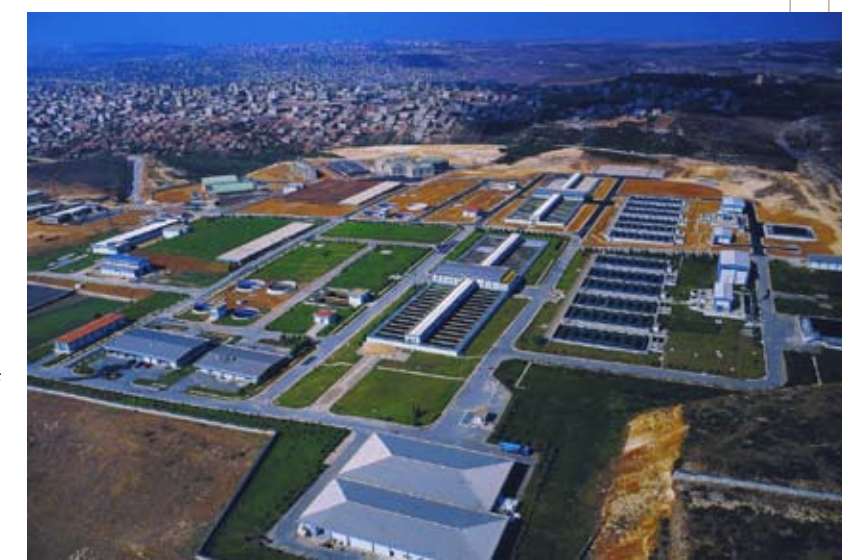
İkitelli Drinking Water Treatment Plant

Forum participants found the opportunity to examine good practices on-site and gain a view over the technologies that are being applied at the water treatment plants. One of the treatment plants that was visited was the Ataköy Advanced Biological Wastewater Treatment Plant, which is the biggest installed advanced biological plant of Istanbul that purifies a wastewater