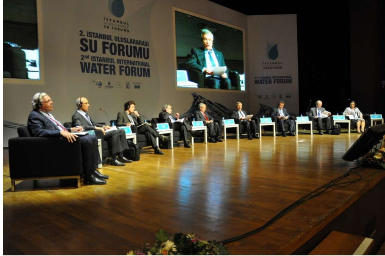
High Level Panel on Water-Food-Energy Nexus