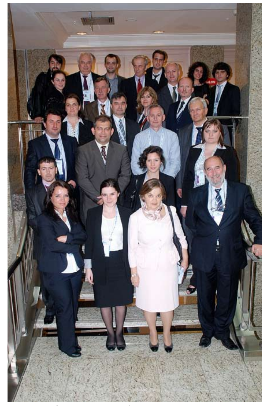
Participants of Eastern Europe Regional Focus Meeting

Implementation of proper IWRM systems including EU Framework Directive, creation of a single coordination and management authority within every country, encouragement of public participation in decision making process as well as bilateralandinternationalcooperation were presented as possible solutions. It was also emphasized that economic analysis and standard measures should be revised in order to increase human and financial resources and supply more technical support.