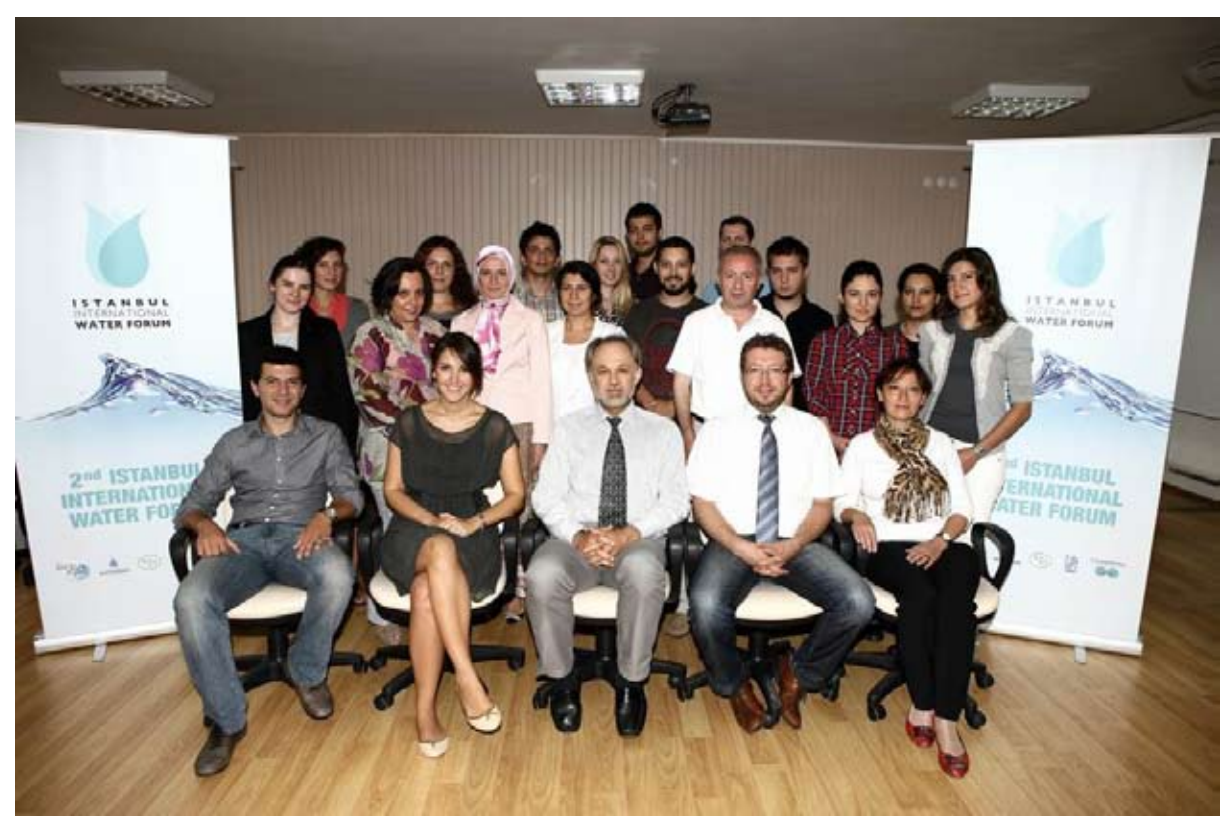
The Forum Secretariat

Last but not least, we would like to thank all Forum participants who contributed towards making the 2<sup>nd</sup> Istanbul International Water Forum a success.