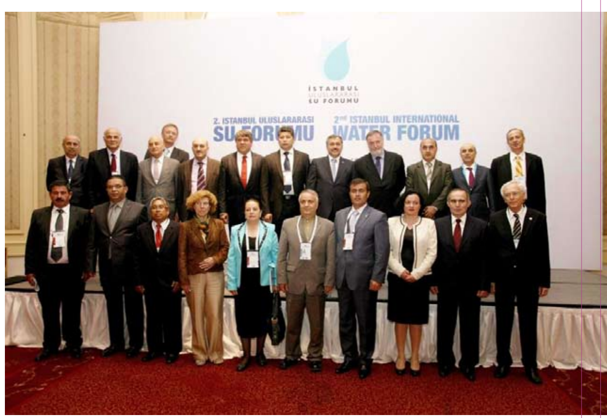
Participants of the Ministerial Meeting at Conrad Istanbul Hotel

On the first day of the Forum, ministers and high-level decision makers from countries of the Forum's focal regions met at the Conrad Istanbul Hotel to share their visions on common water challenges and explore areas of cooperation at the Ministerial Meeting organized by the Foreign Relations and EU Department of the Ministry of Environment and Forestry. During the meeting, ministers, representatives of international institutions and top-level water executives discussed the topics essential in overcoming global, regional and local water challenges.