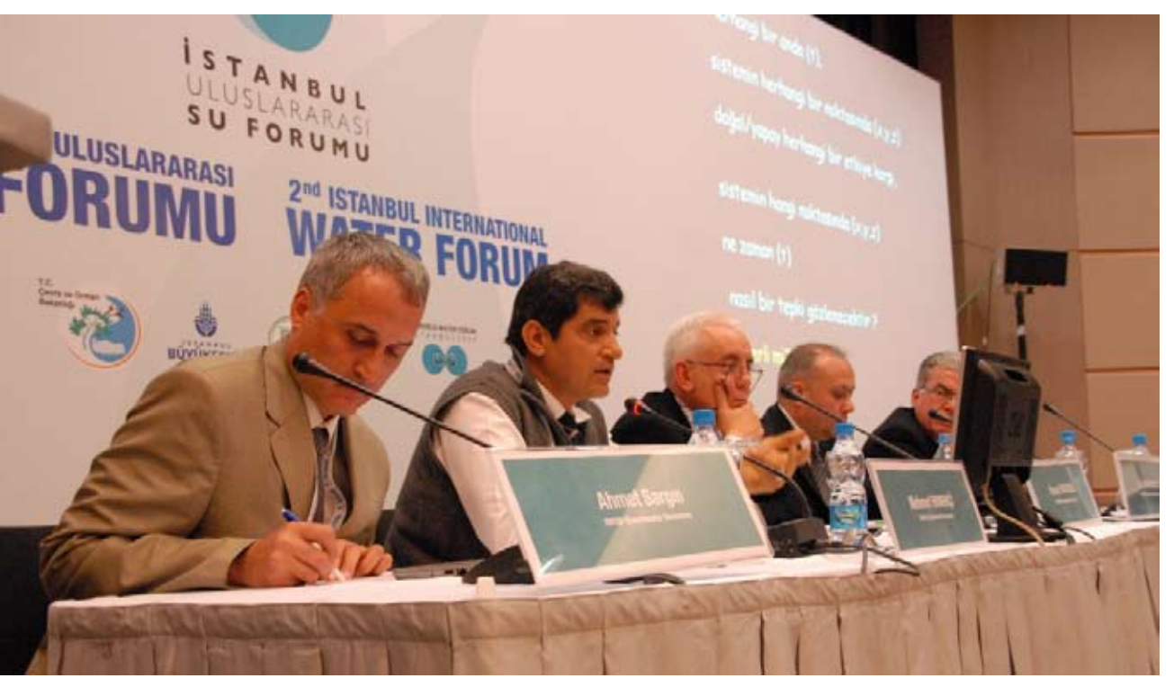
Panellists of Session 6.2. IWRM - Groundwater Resources