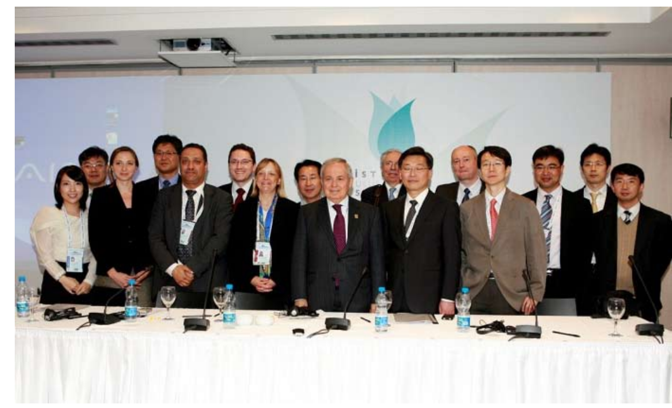
Organizers and panellists of the side event "Water as an Engine for Growth"

Green growth is about fostering economic growth and development, while ensuring that the quality and quantity of natural assets can continue to provide the environmental services on which our well-being relies. It is also about fostering investment, competition and innovation, which will underpin sustained growth and give rise to new economic opportunities. In this side event, case studies on water and green growth from Africa, Latin America and Asia were presented. Also, activities of East Asian Climate Partnership, contribution of hydropower and models that both encourage growth and investment in the natural capital to support local economies were discussed.