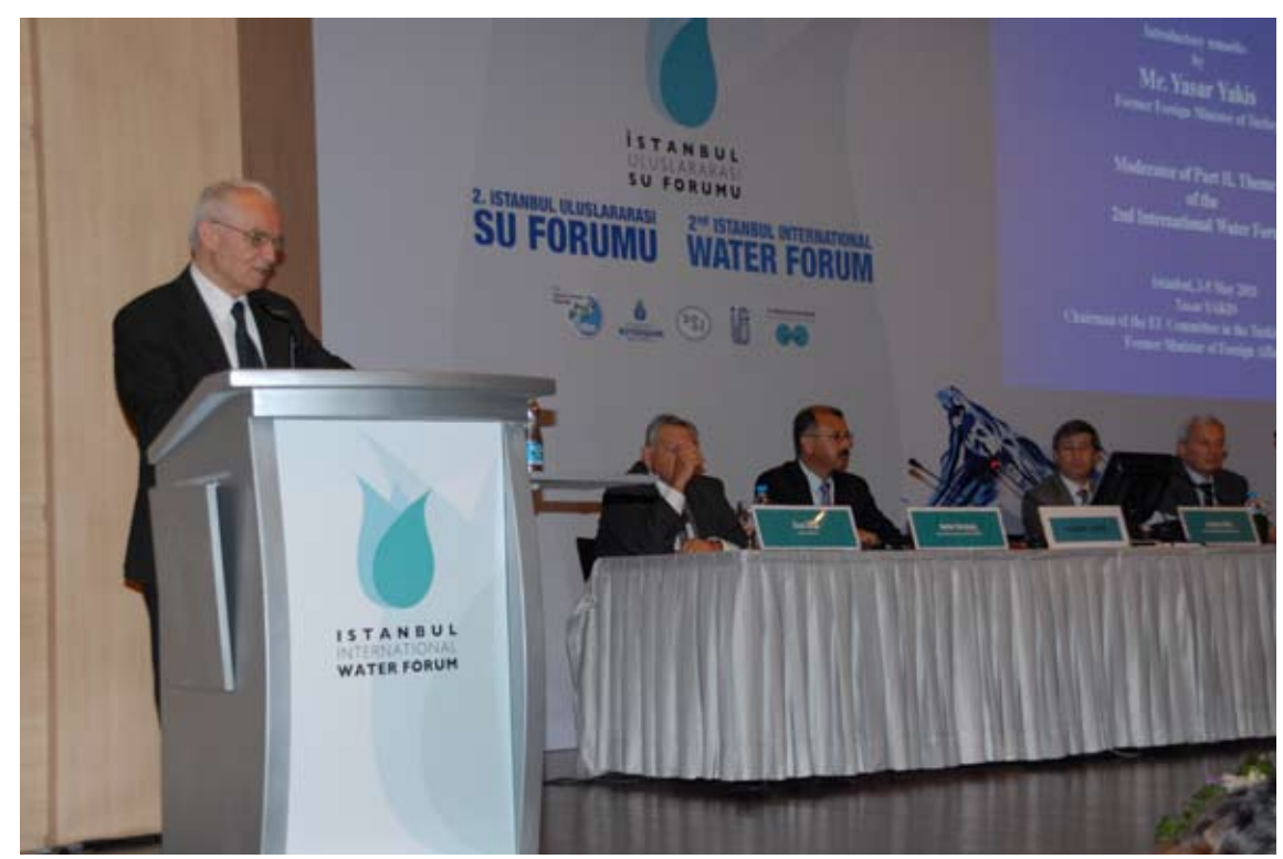
Yaşar YAKIŞ, Former Minister of Foreign Affairs of Turkey, giving an introductory speech in Session 1.2. Regional Technical Cooperation on Water II

More than hundreds of scientists, engineers, representatives of private and public sector and the civil society were congregated in the sessions to highlight new mechanisms, solutions and approaches to regional water problems. Highlights derived from each theme were further discussed in the wrap-up sessions and were then brought to the related High Level Panels.