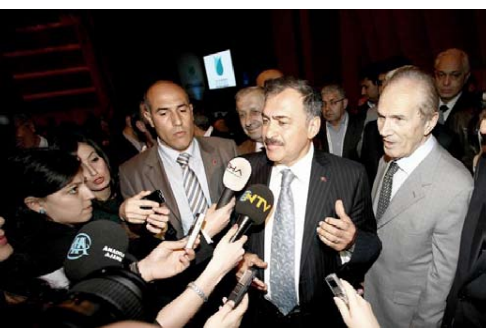
Prof. Veysel EROĞLU, Minister of Forestry and Water Works of Turkey, talking to the press after the Opening Ceremony

of the International Office for Water gave exclusive interviews. The 2<sup>nd</sup> Istanbul International Water Forum also featured in the "Gelecek Gündemde" (Future Agenda) programme on CNNTurk - a series of films highlighting solutions to some of the key global challenges for 2020.