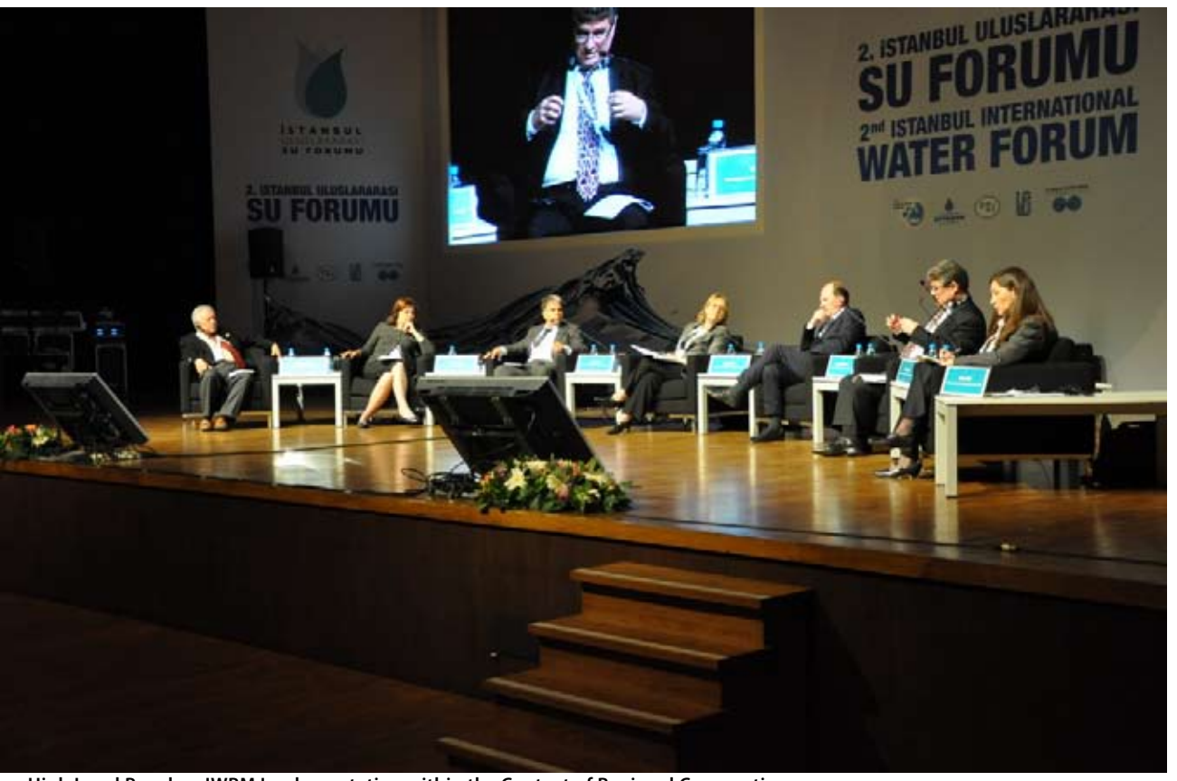
High Level Panel on IWRM Implementation within the Context of Regional Cooperation

The aim of this High Level Panel was to detect the available cooperation options required for handling the water-related problems of the Forum's focal regions. In order to meet the quantitative and qualitative standards of water, there is a need for implementing a well-functioning IWRM with the participation of multiple stakeholders. This session emphasized the need for mutual awareness among downstream and upstream riparians, information and technology sharing, and cooperation among state, private sector and the academia at micro level as tools for mitigating the complexities of politics and maintenance of peace. In other words, maintaining stable political conditions and improving technical cooperation were covered as mutually dependent variables. Besides implementation of an integrated water management plan, an inclusive system of good governance that can coordinate the roles of legislative, financial and political authorities was offered as a preferred choice.