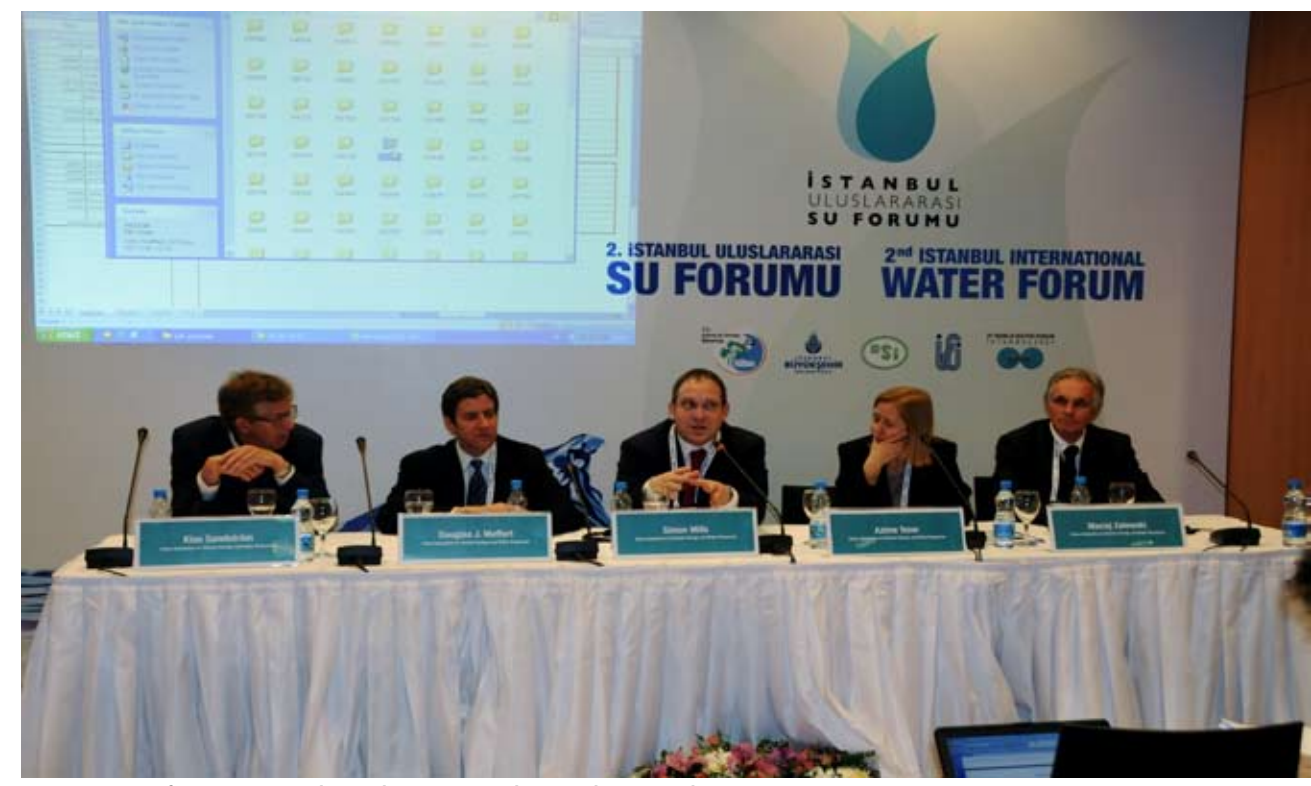
Participants of Session 4.3. Urban Adaptation to Climate Change and Water Resources