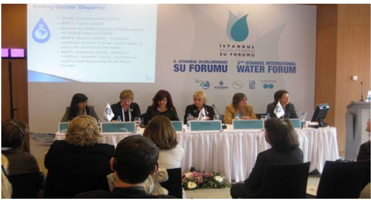
Panellists of the side event "Women and Water Policies"

Women are the most affected from water poverty. Although they play a central role in the supply, management and safeguarding of water, they are not equally involved in decision-making. In this side event, panellists pointed out the vital importance of women's inclusion and the accountability and transparency of the water management process. Institutionalization was underscored as essential in the facilitation of effective water management and equality in gender representation.