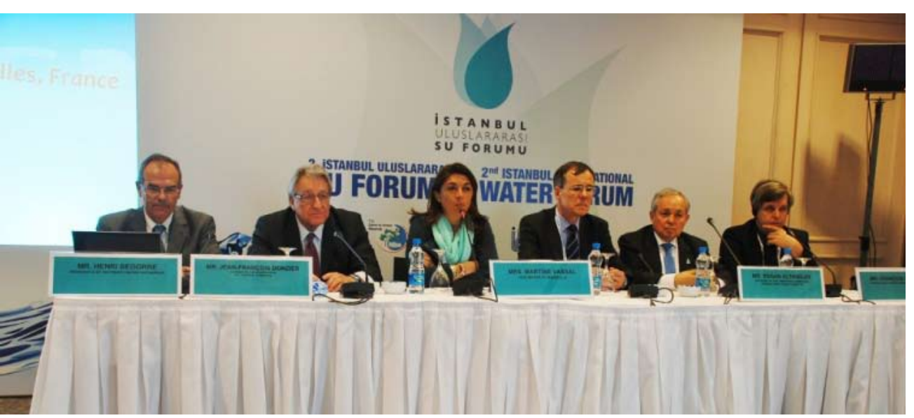
Members of the 6th World Water Forum International Forum Committee

The preparation process of the 6<sup>th</sup> World Water Forum, which will take place in Marseille between 12-17 March 2012 was explained in detail. The speakers consisted of members from various processes of the organizational team of the 6<sup>th</sup> World Water Forum. Objectives and framework of the Forum and the action plans to reach concrete solutions were discussed. It was emphasized that the Forum will be realized with the cooperation of all stakeholders, including NGO's, governments, parliamentarians and ministers.