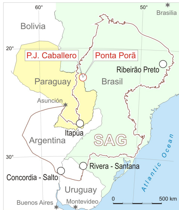
Figure 1: General location map

After the finalisation of the SAG-GEF project in 2009, international agreements have been approved to promote future SAG groundwater initiatives, including the creation of a regional groundwater institute by the Mercosur Parliament in November 2009 (INRA-Mercosur) with specific reference to the shared management of the SAG. And consequently, in August 2010 the agreement about the responsibility for a common and sustainable management (acuerdo sobre el Acuífero Guaraní) has been signed by the four SAG participating countries Argentina, Brasil, Paraguay and Uruguay.