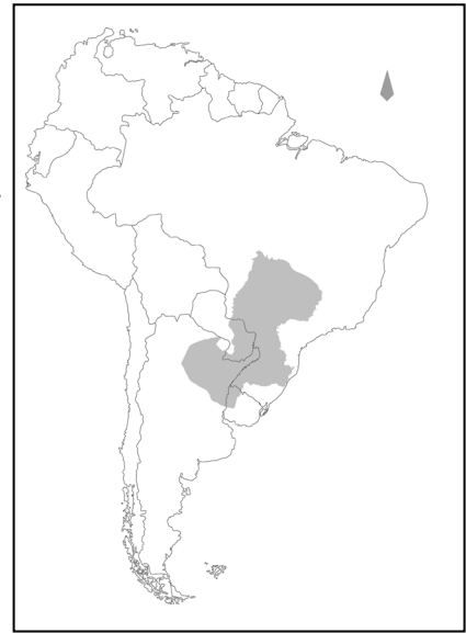
Figure 1: GAS localization

Into the SAP process Argentina, Brazil, Paraguay and Uruguay defined a list of national priorities to improve groundwater management; developed Guarani aquifer tailored made management instruments and finally agreed a cooperation structure to integrate all necessary efforts and to support technical instruments functioning and maintenance. The main treats of national and sub-national institutions now are the implementation of all Guarani management instruments, the priorities in national and sub-national level to strength groundwater and water resources management and cooperation framework proposed. The cooperation framework will support local, national, sub-national and regional priorities implementation and to develop an effective integration between different technical institutions responsible to groundwater management. August 2010, Argentina, Brazil, Paraguay and Uruguay signed the Guarani Aquifer Agreement and parliamentary approval is required in all countries. The agreement shows the way to strength Guarani Aquifer management and setup countries to proceed to the SAP implementation process.