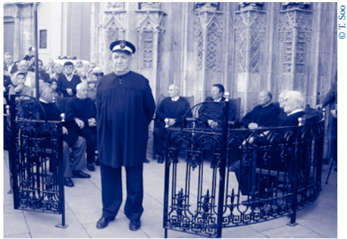
Valencia, Spain (see article p.3)

In accordance with recommendations of the Scientific Committee this seminar will be organised on the "back to back" scheme (people of two different countries exchanging during field works in the two countries ). This seminar format was specified in the initial project proposal. In this way the coming meeting will allow to evaluate the real feasibility of this approach from technical, financial and logistics points of view. The final agenda (2005 -2006) and the topics of the following seminars will be fixed depending on the results and lessons learned from this event.